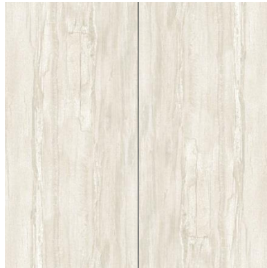
Colour: PEARL Code: BOREAL-PEARL-12X24 Packing details: 2 sf/pc, 8 pc/box, 40 bxs/plt, 320 pc/plt, 64 lbs/box