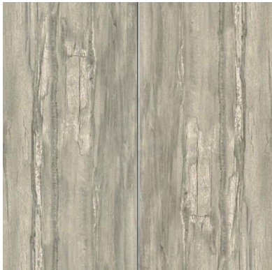
Colour: IRON Code: BOREAL-IRON-12X24 Packing details: 2 sf/pc, 8 pc/box, 40 bxs/plt, 320 pc/plt, 64 lbs/box