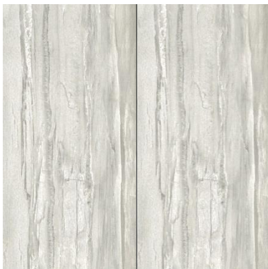
Colour: SILVER Code: BOREAL-SILVER-12X24 Packing details: 2 sf/pc, 8 pc/box, 40 bxs/plt, 320 pc/plt, 64 lbs/box

Ceramic Tile should be installed using standard installation methods as recommended by the Tile & Marble Association of Canada (TTMAC) www.ttmac.com .